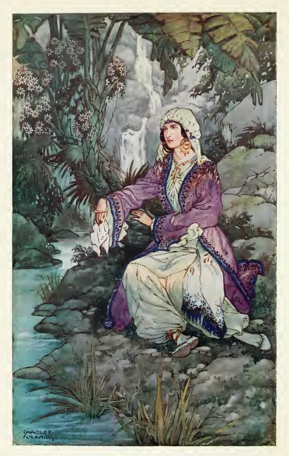
" ON THE BANK NEAR BY SAT A YOUNG MAIDEN WEEPING" Page 134