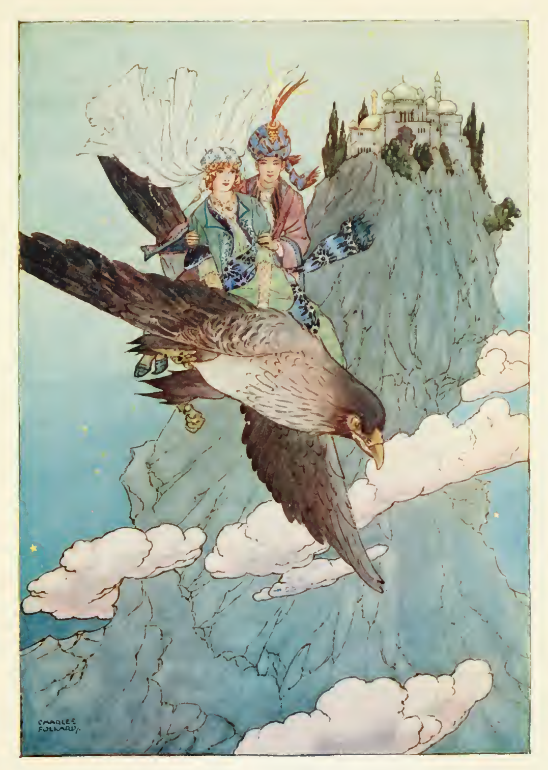
" OUR HERO MOUNTED WITH HER ON THE FALCON'S BACK, AND DESCENDED FROM THE MOUNTAIN"