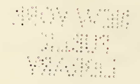
Published Autumn, 1915