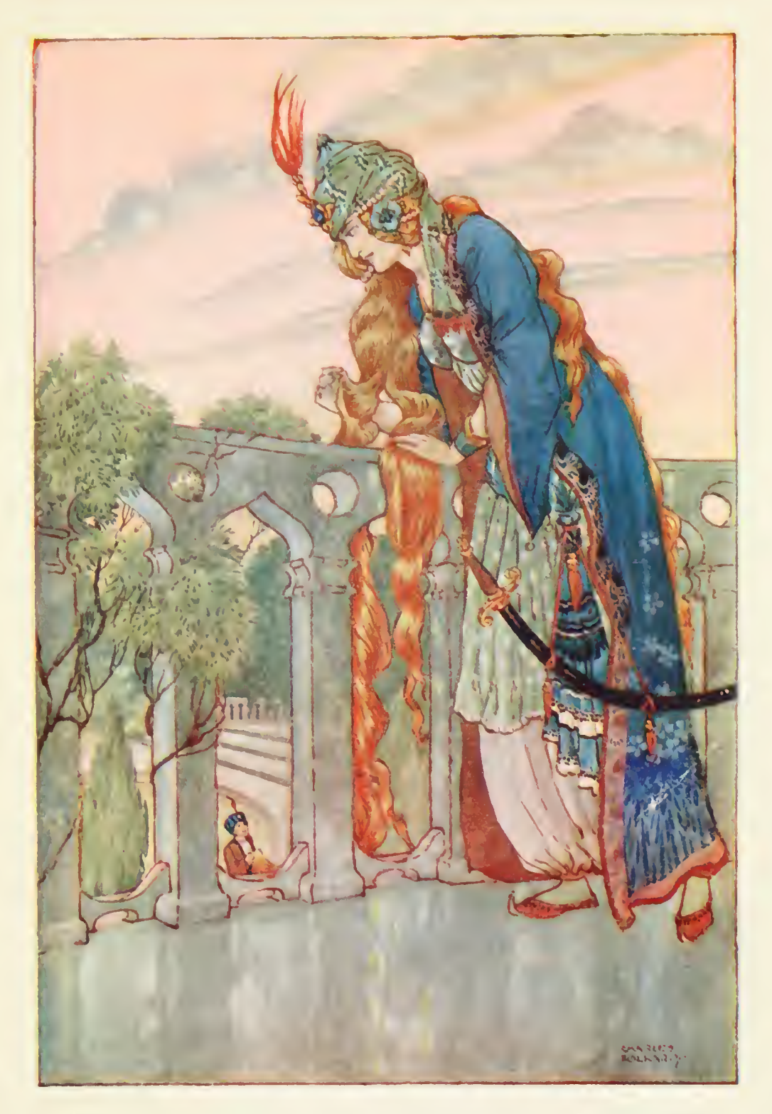
<sup>(1)</sup> HE HELD THEIR CURLING ENDS IN HIS HANDS AND COVERED THEM WITH PASSIONATE KISSES <sup>(1)</sup>