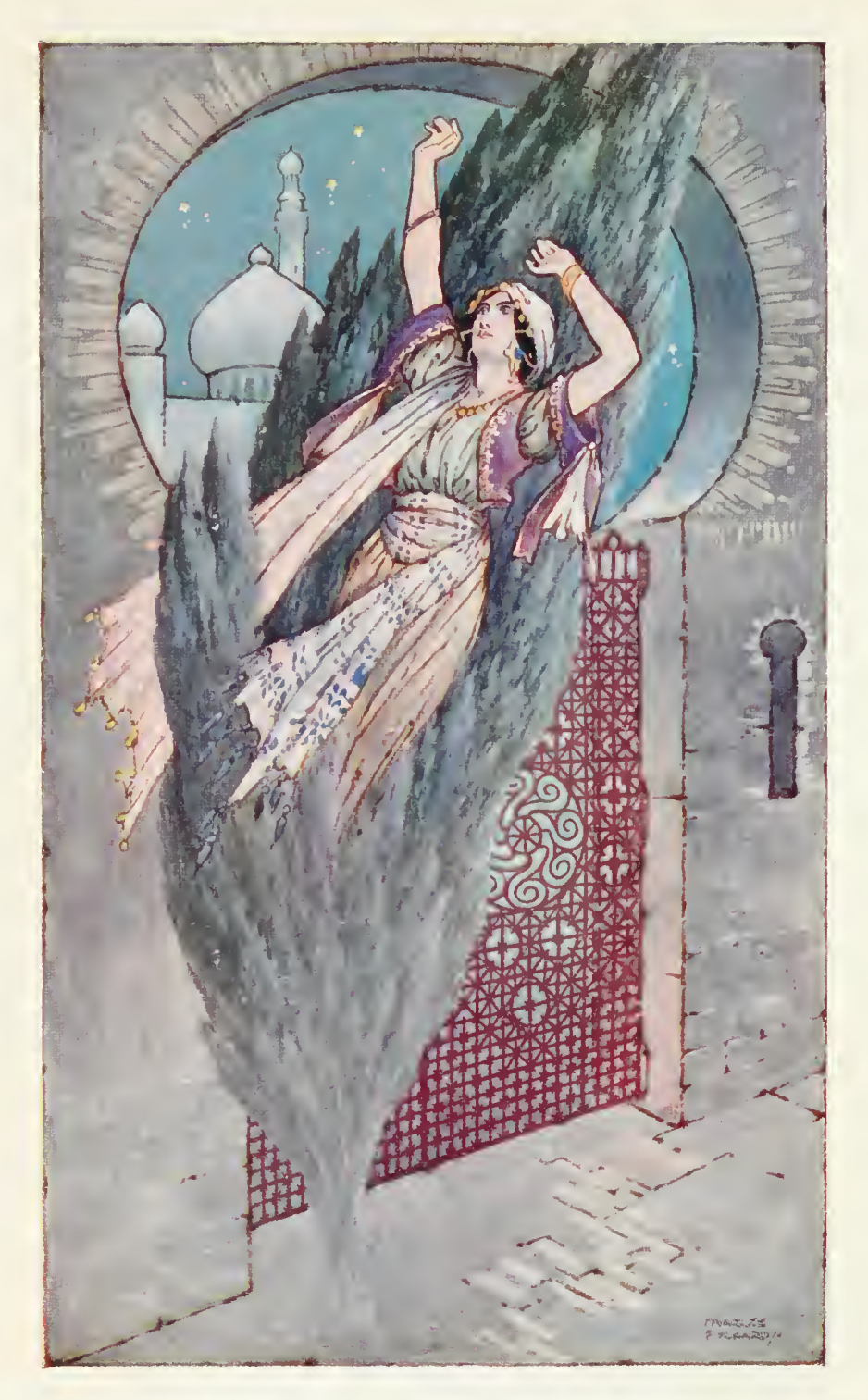
" PERIS, MY GODMOTHERS ! CHANGE ME INTO A CYPRESS !" Page 20