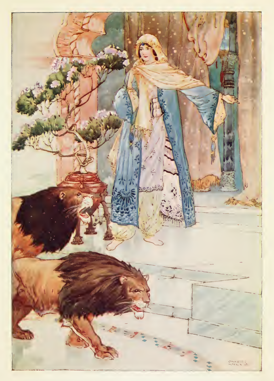
" SHE CALLED THE LIONS AND ASKED THEM, "WHY DID YOU LET THIS MAN IN ? " "