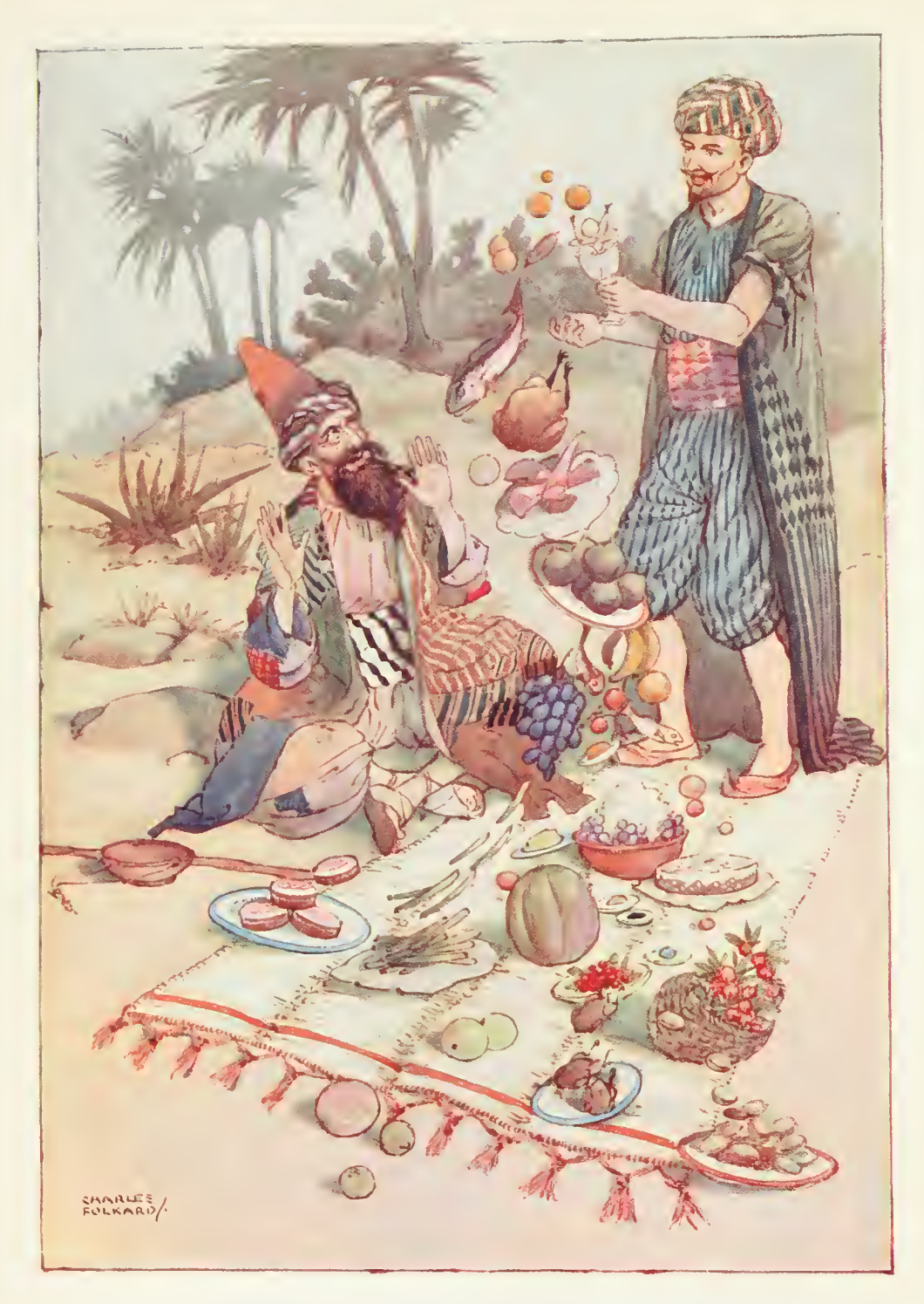
" SILVER CUP OF MINE !' SAID HE, ' BRING FORTH THIRTY KINDS OF FOOD FOR ME TO EAT WITH MY FRIEND THE DERVISH '"