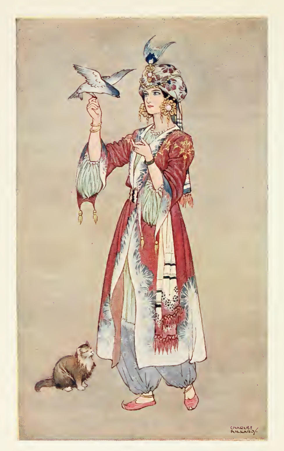
" THE BIRD SHE BADE FLY HIGH AND SWIFTLY, AND THE KITTEN SHE PLACED ON HER LAP"