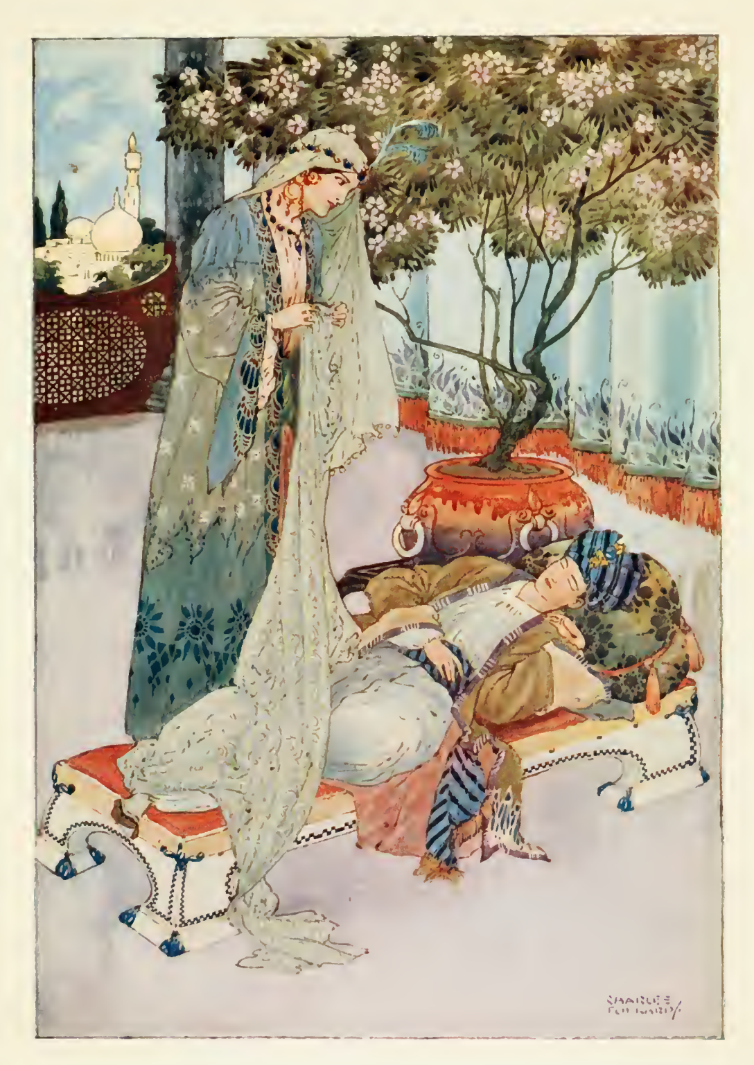
^{\prime\prime} SHE FORGOT INS CHARGE TO HER, AND SHE BENT AND KISSED HIM ^{\prime\prime} Page 113